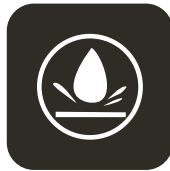
Front Panel IP65